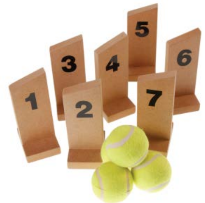
Table Tennis Ball Throwing Game

The Table Tennis Ball Throw Game is a super game of skill for all ages. Try and get the balls into the numbered squares, highest score wins!